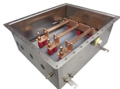
TLb-GND Series Link Box with Ground Bars