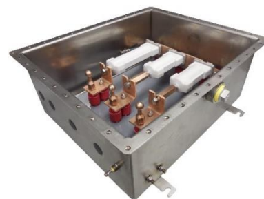
TLb-ARR Series Link Box with Surge Arresters