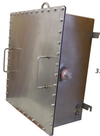
Link Box 316 Stainless Steel