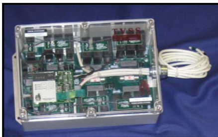
Compact, Non-field Replaceable SPD

Applications: Service Entrance, Main Distribution, ATS & Critical Equipment