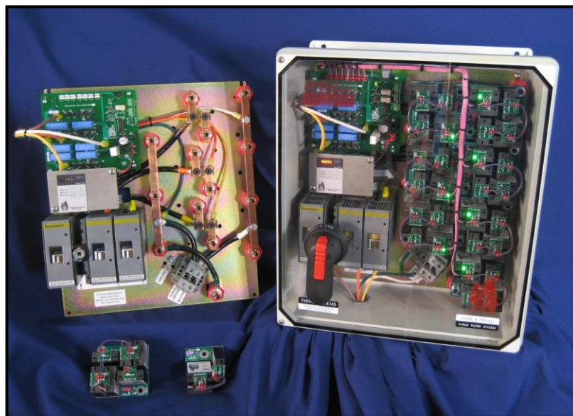
Complete Hybrid System

Finally, THOR SYSTEMS added the filter capacitors to provide protection for events that occur below the conduction point of the TpMOV/TVS diode array. This protection is referred to by many names from various suppression system manufacturers – sine wave tracking, noise attenuation, capacitive filtering, etc. – to effectively attenuate events initiated by energizing/de-energizing motors, transformers, capacitor banks and other reactive based equipment. Whatever name is used, the industry standard for filter attenuation is MIL STD 220A and THOR SYSTEMS offers filter capacitor networks with attenuation levels in excess of 50dB to address those occurrences.